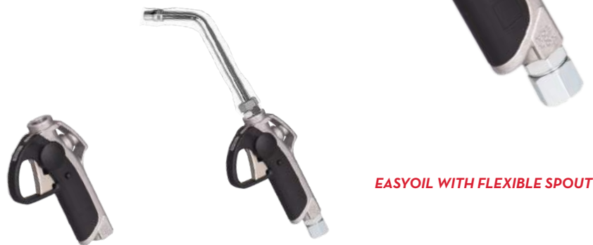
EASYOIL WITH FLEXIBLE SPOUT