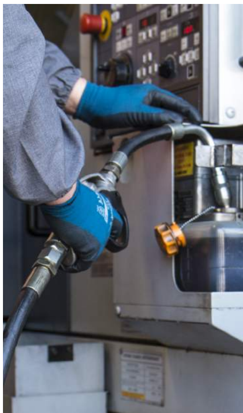
with rigid spout