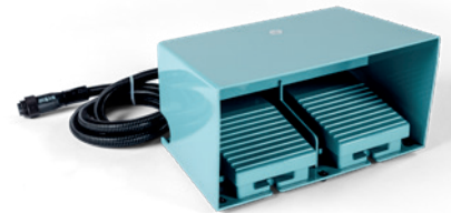
Foot pedal as an option.